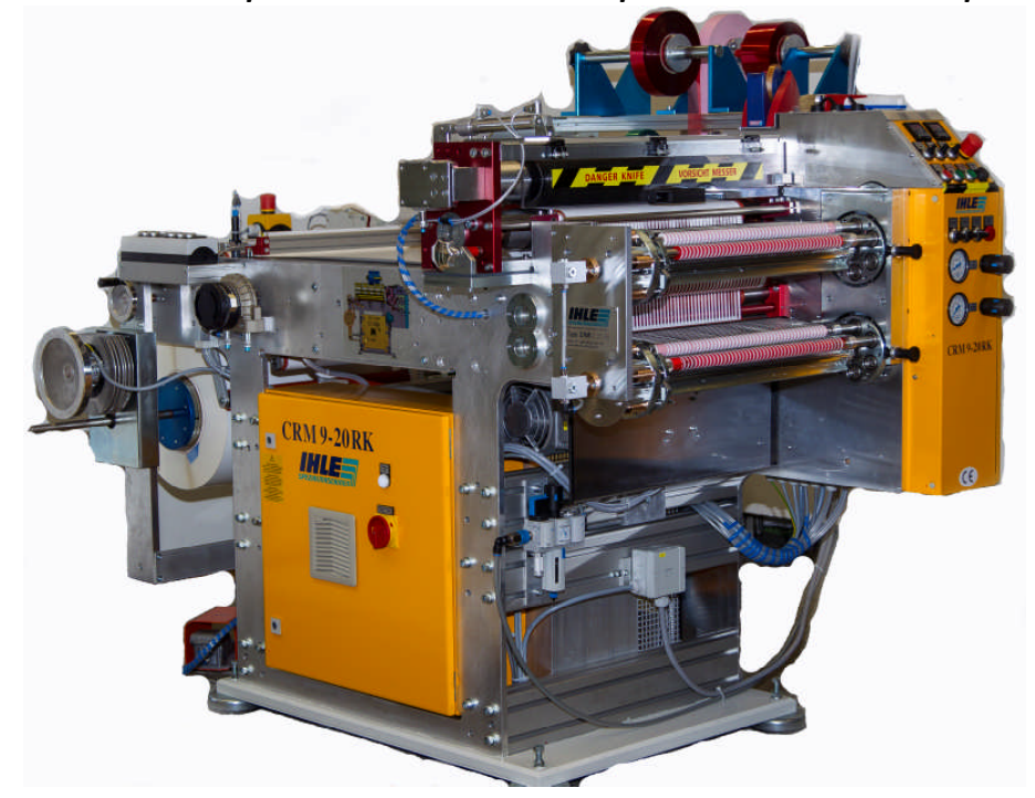
CRM 9 Series

short, narrow tapes, correction tapes and related products